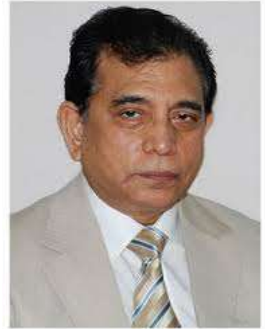
Dr. Lalji Singh Genome Foundation