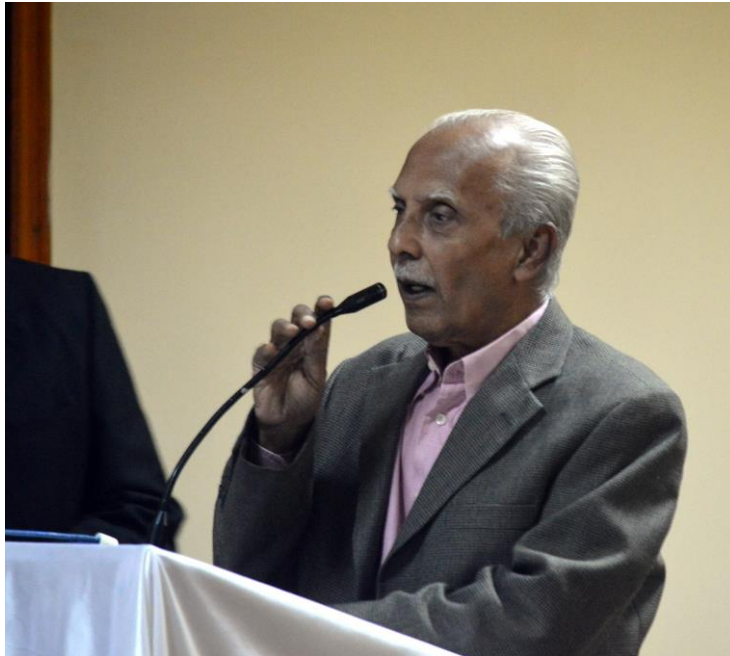
Prof. H. Sharat Chandra Centre for Human Genetics

Department of Biotechnology IIT Madras, Chennai & Dr Joseph Thomas Memorial Science Club