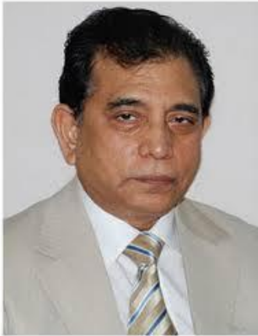
Dr. Lalji Singh Genome Foundation